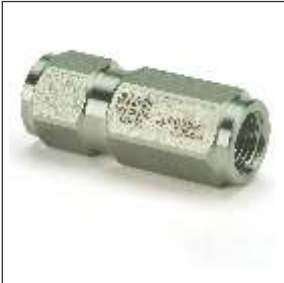
Non Return Valve