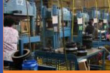
Rubber Molding Machinery