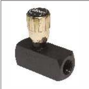
Flow Control Valve