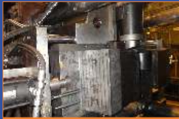
Metal Die Casting