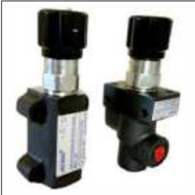
Pressure Relief Valve