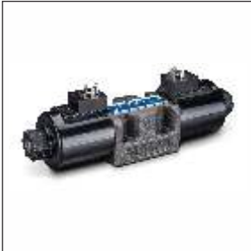
Direction Control Valve (Lever Operated & Solenoid Operated)