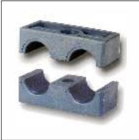
Hydraulic Pipe Clamps